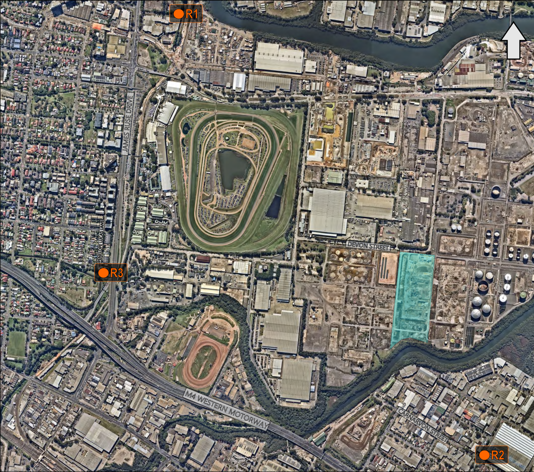
FIGURE 1 LOCALITY PLAN REF: MAC201090