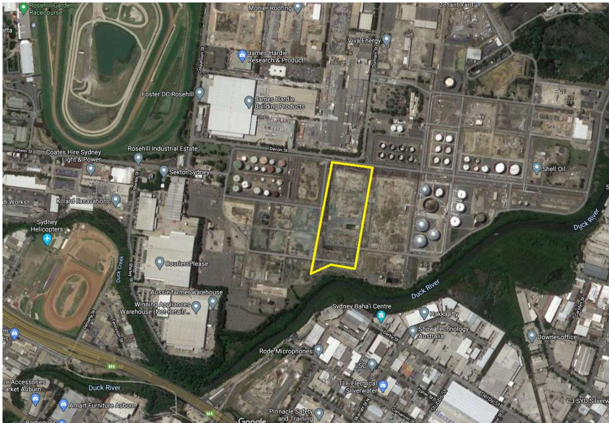
Figure 6.1 Site location